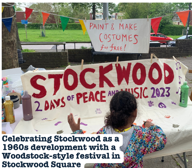
Celebrating Stockwood as a 1960s development with a Woodstock-style festival in Stockwood Square

You can buy the book from our ONLINE SHOP .