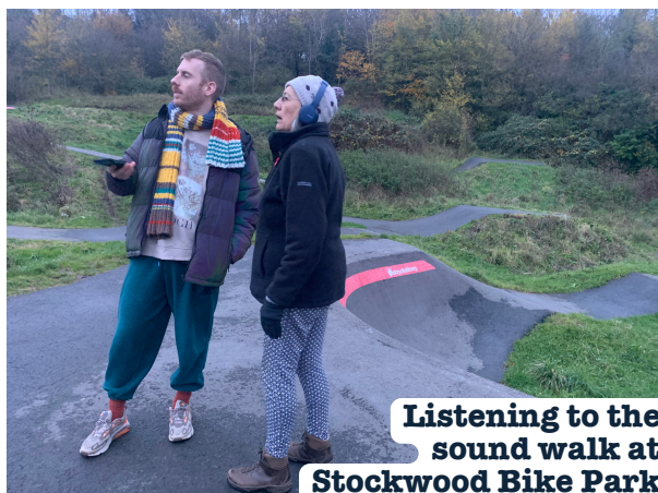
Listening to the sound walk at Stockwood Bike Park