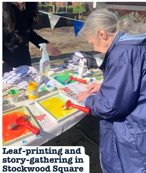
Leaf-printing and story-gathering in Stockwood Square