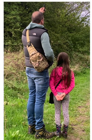
Recording birdsong at Stockwood Open Space Nature Reserve