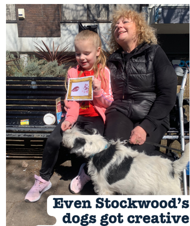
Even Stockwood's dogs got creative making paw-prints!