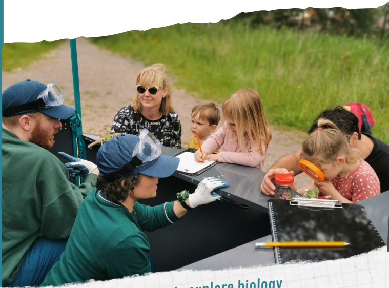
Earth Experts explore biology

Finally, the participants are then invited to think hard about their favourite discovery made during the session whilst wiggling their fingers in the direction of the spaceship. This ritual triggers a light show as LEDs on the spaceship flash and pulse, receiving power from the discoveries. Fully powered, the spaceship is ready to fly to its next discovery location.