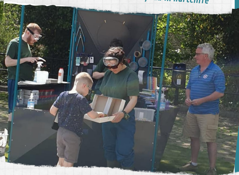
at the pop-up park, Calne