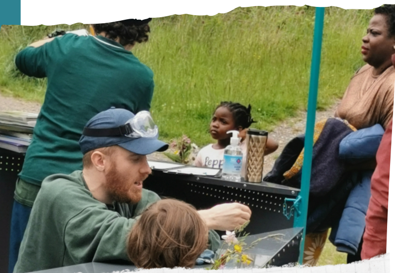
a biology-based discovery session in Hartcliffe, Bristol

The physics version works best indoors , the others work well outdoors ).