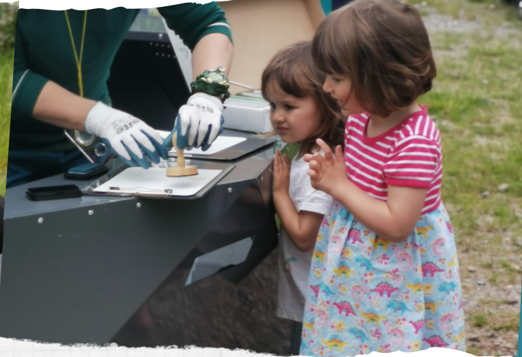
at a summer holiday discovery lab in Hartcliffe