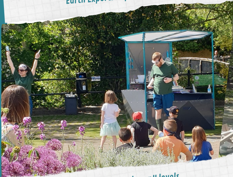
Earth Experts explore pH levels