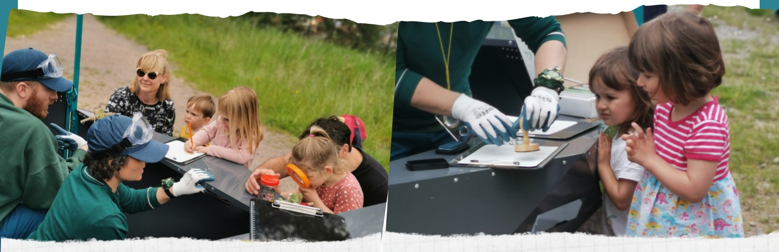
Earth Experts explore biology

Participants are encouraged to draw or write about their discoveries. These are pegged up around the spaceship for use in the improvised theatre which happens straight after the workshop.