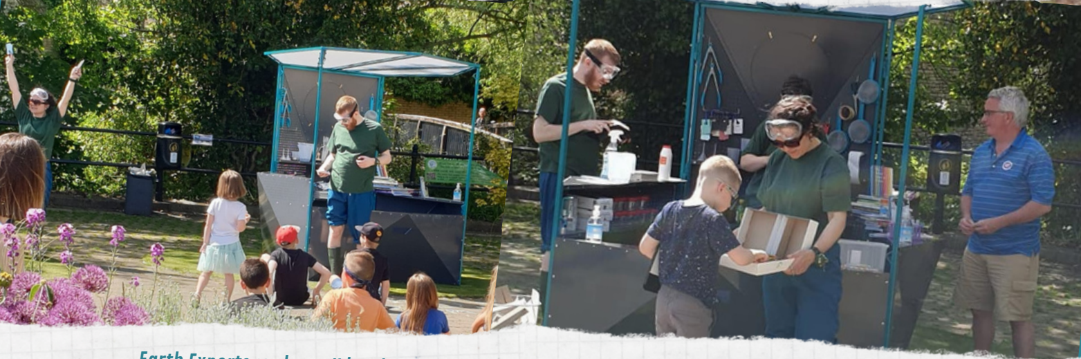
Earth Experts explore pH levels